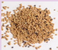
Mustard Seed is Tiny