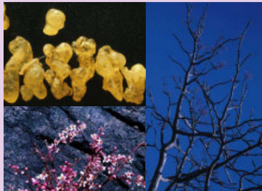
Frankincense is from the Boswellia

Frankincense is prepared from the gum of several species of Boswellia ( Burseraceae ) trees and shrubs native to the Arabian peninsula and North Africa. The incense is the gummy resin which can naturally ooze from the plant or cuts may be made to stimulate oozing.