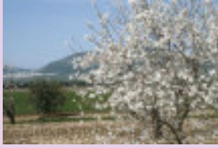
The almond is mentioned six times in the bible.

The common fig, Ficus carica , is the most widely planted fruit tree in Bible lands. The tree lives up to two hundred years so is often planted with olive trees, which are also long lived.